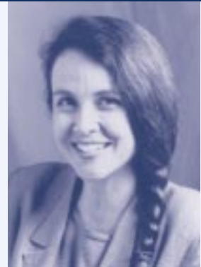
Naomi Shihab Nye