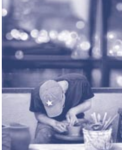
Cleveland Institute of Art.

Mid-sized arts organizations play a pivotal role in the ecology of the cultural sector. They nurture the creation of new work, provide artistic research and development, serve as the training ground for young artistic and administrative talent, and often anchor arts organizations in smaller metropolitan and rural areas. Yet they have few foundation sources for sustained support. National research indicates that this sector has become particularly fragile. What is the rationale and payoff for a foundation’s long-term investment in mid-sized organizations? The Bush Foundation is in the final phase of a major commitment of strategic operating support to twenty-one