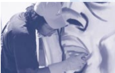
Cleveland Public Art's City Xpressionz Aerosol & Urban Art Festival.