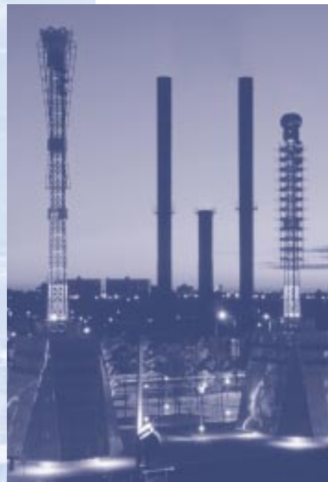
Gateway Sports Complex, R.M. Fischer (Artist), Sport Stacks, Gateway Plaza Columns. Photo: © Don Snyder (top) Public Square was illuminated using an electric street lamp in 1879, invented by Charles Brush for what became General Electric. Photo: © Don Snyder (left) Steel mills in Cleveland. Photo: © Don Snyder