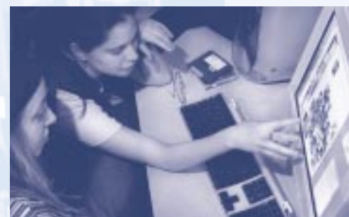
Cleveland Institute of Art.