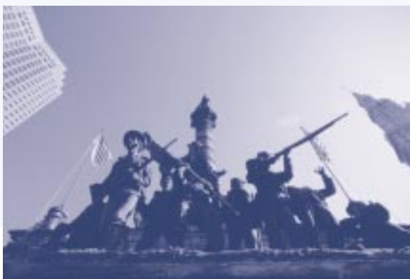
Soldiers and Sailors Monument, 1894, on Public Square.