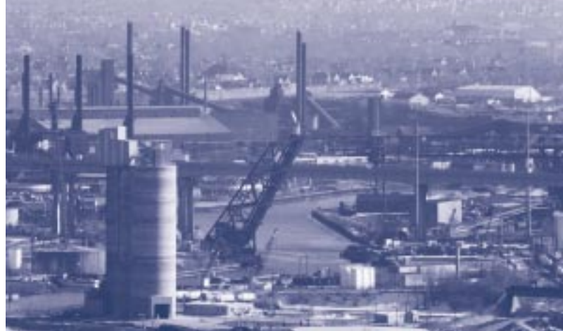
The Flats, Cleveland.

The lines between arts and environmental grantmaking often are sharply drawn. In the life of thriving communities, these two areas are integrally linked. This roundtable provides a chance to discuss grantmaking strategies and approaches for community-building through the integration of arts and environment. There will be opportunities to share information about new local, regional, and national models, and partnerships that are bringing together the arts and environment sectors. Participants will brainstorm ways that GIA members can increase and strengthen connections with colleagues who specialize in support to further cross-sector work. This session complements Wednesday’s member report.