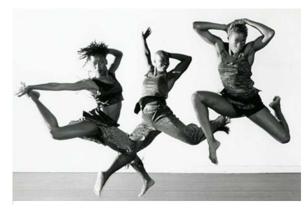
Urban Bush Women in performance.

Community engagement residencies are designed to respond to specific issues that are important to the host community. The focus in Tallahassee, Florida, for example, was HIV/AIDS awareness and prevention; in Flint, Michigan it was incorporating the arts as a