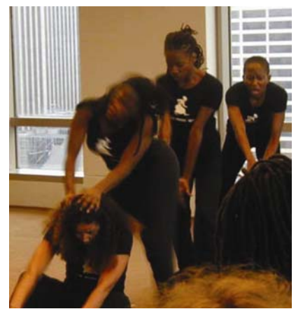
UBW Dancers perform the Hot Comb Blues at a Hair Party.

Each Hair Party was unique but all incorporated small and large group discussions, performance excerpts that stimulated dialogue, and interactive games to prompt memories and associations from participants. They began with a mutual agreement that participants would be open and